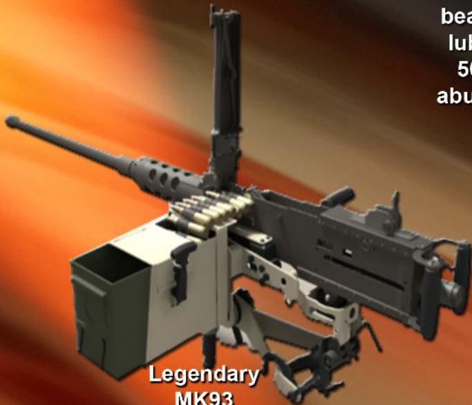
Legendary MK93 Gun Mount

This new gun application sees salt water and harsh conditions: shock, weather and high, shifting moment loads. Bearing pillow blocks, shells and snap rings will be 316 stainless steel (prototype blocks shown are aluminum for fast turn-around and testing). The bearing shells are lined with LM76's renowned self-lube Minuteman PTFE Composite. Taking a load of 5000 PSI, Minuteman is tops in its field for taking abuse. Since Minuteman employs no abrasive fillers, it performs beautifully on soft 300 series stainless steel shafting.