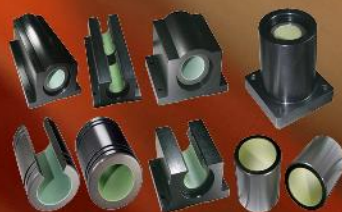
Standard Minuteman Bearings, Pillow and Flange Blocks