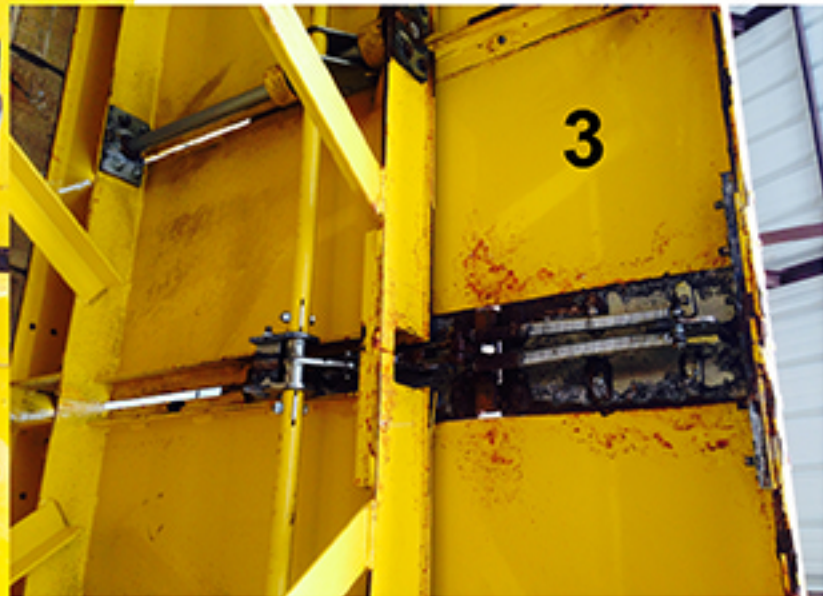
A Working System