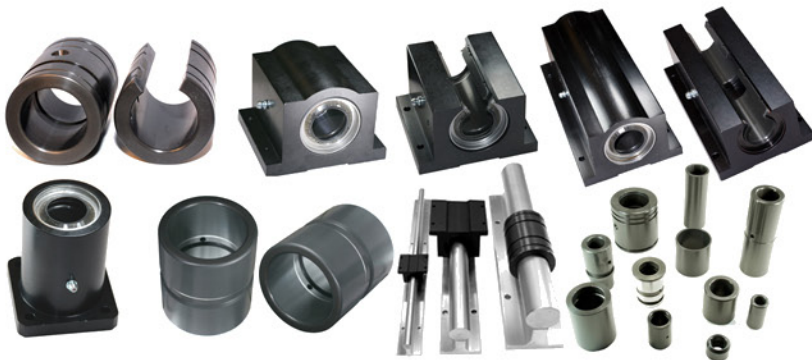
Black Racer Family of Linear Bearings

Join The Black Racer Squadron today! Get a free squadron patch or an 11"x17" poster by calling Christine @ 1-800-513-3163